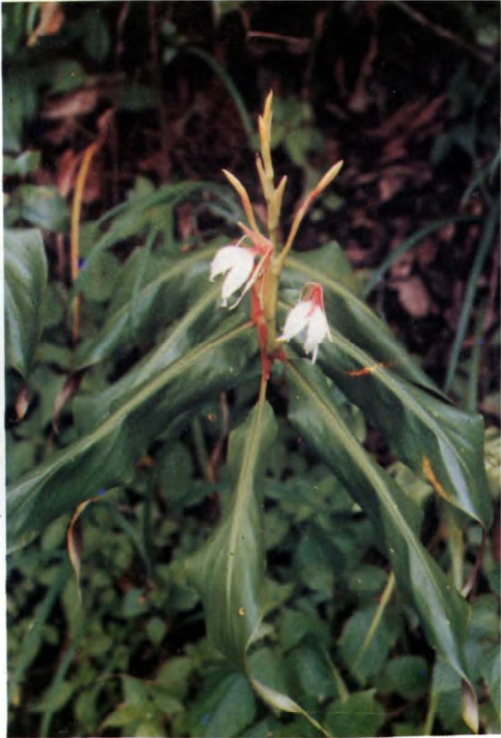
Hedychium spicatum Buch. Ham. ex J.F. Smith