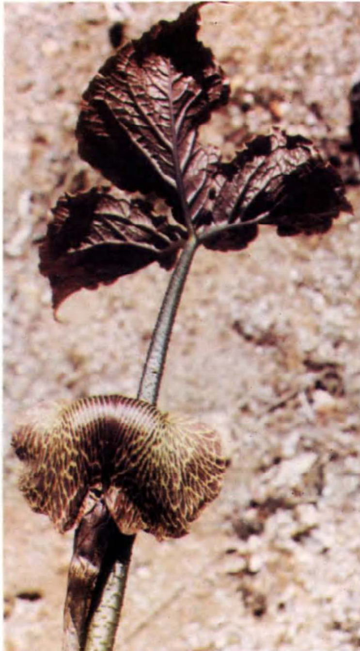
Arisaema griffithii Schott.