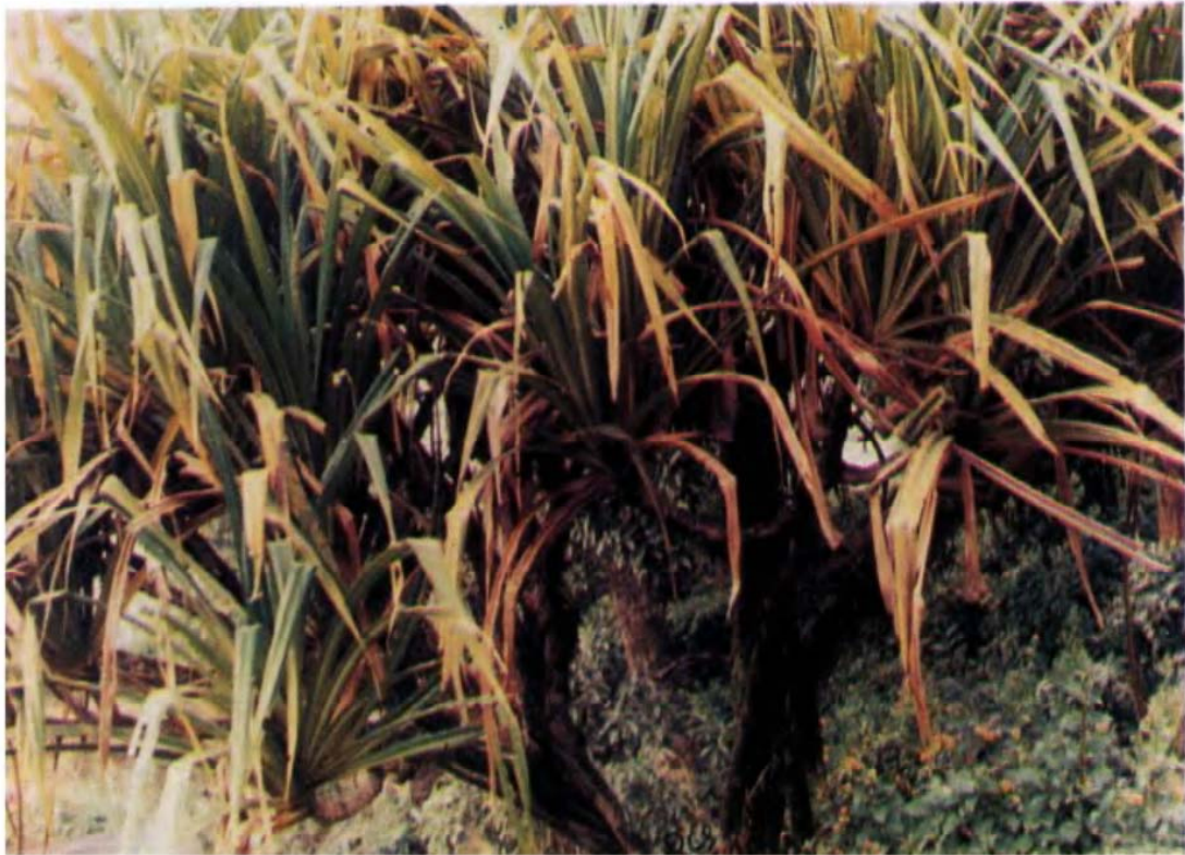
Pandanus nepalensis St. John