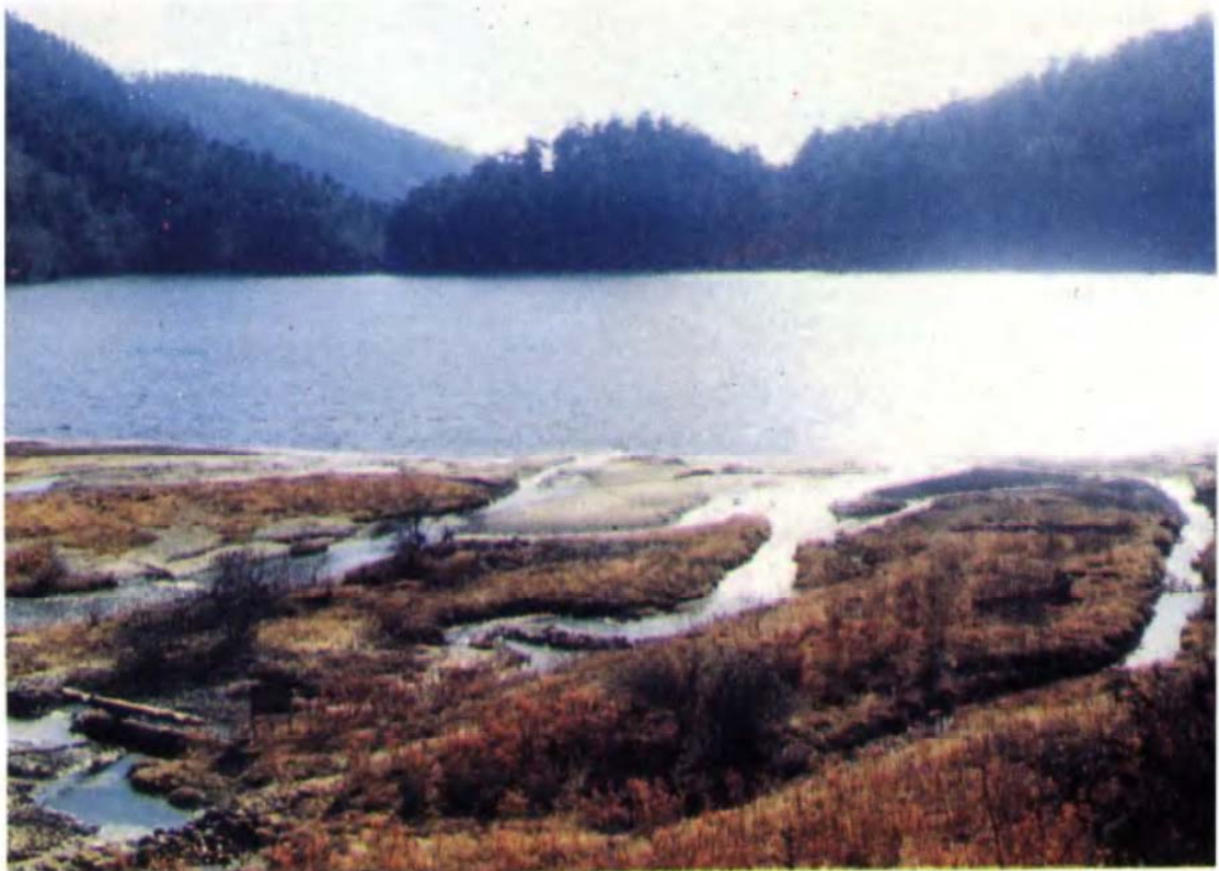
Maimaichu Lake (East Sikkim District)